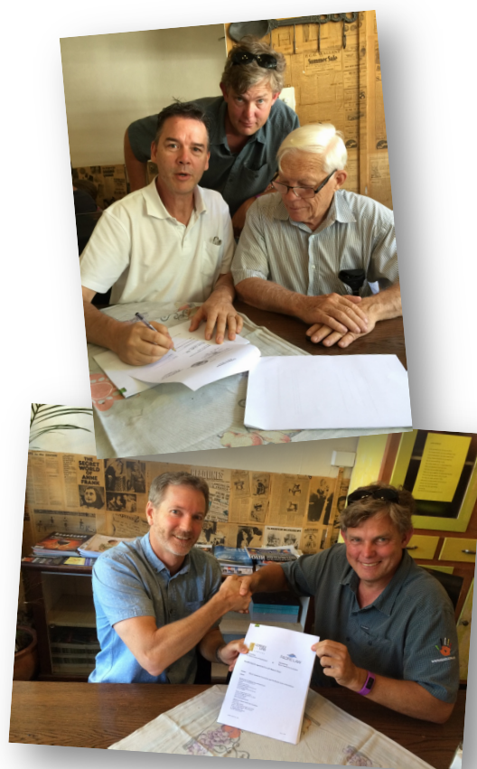
Signed of Agreement between MTC and QCCC

We are operating in cooperation with our Keswick Road neighbour QCCC. We are continually enhancing the lines of communication and relationship building as we work together for our mutual benefit. We have been able to cooperate with one another in mission and ministry through sharing vision and resources that God has put before us. These are just some of the things I