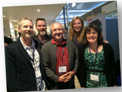
CMA National Conference

great to see a large contingent of MTCC personnel, including volunteers, present. There was an opportunity to network with other individuals and organisations for cross pollination of ideas and resources. Our crew were very encouraged with the various workshop training and messages that were presented. It was also a lot of fun for MTCC people to spend time together.