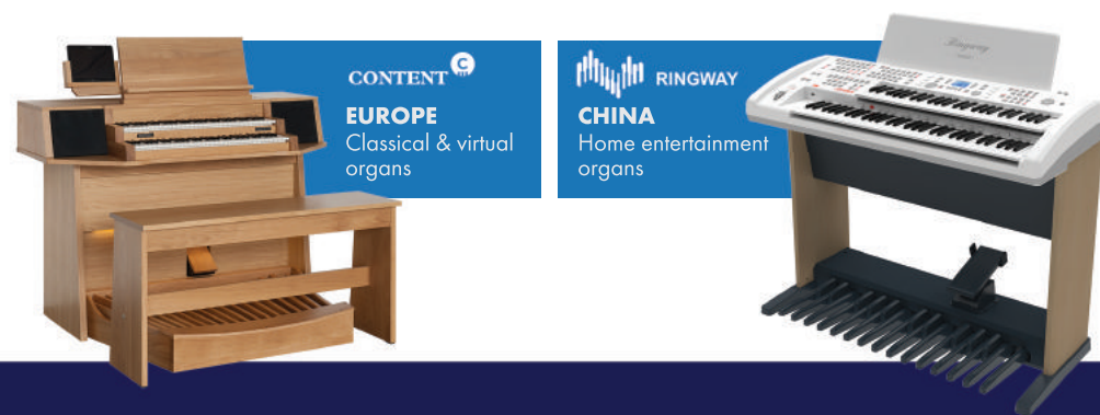
CONTENT EUROPE Classical & virtual organs