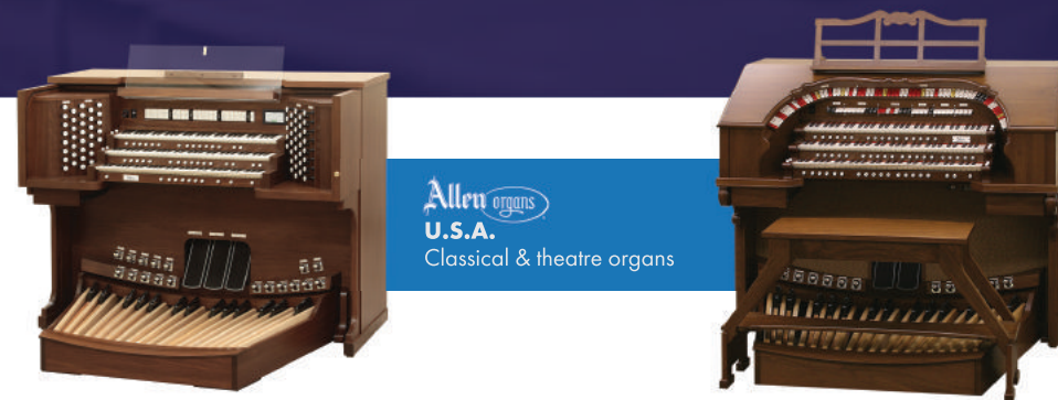
Allen organs U.S.A. Classical & theatre organs

All Organs offers Australia's widest range of organs to suit any budget, need and taste.