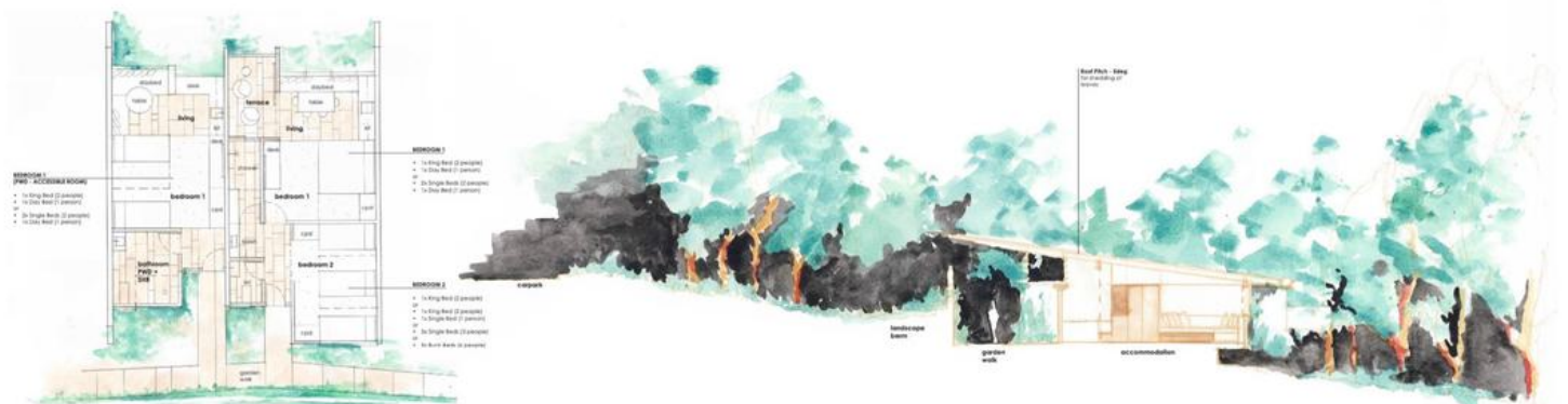
TYPE A | ACCOMMODATION