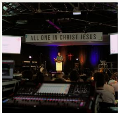
Y CONFERENCE: SOUND, LIGHTING AND TECH PROVIDED BY QCE COLLECTIVE

We have years of experience running tech at MTCC, in fact - it's where the company got started! Make your next event at MTCC really special by investing in the expertise of people who know the tech at MTCC better than you know the back of your hand.