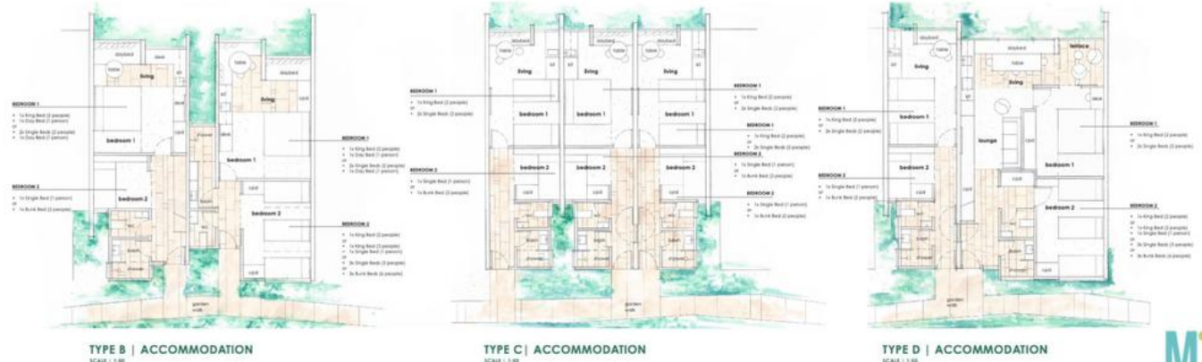
TYPE B | ACCOMMODATION