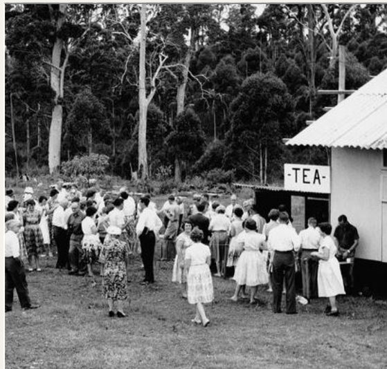
MORNING TEA BEING SERVED AT THE PARTIALLY FINISHED PANORAMA HOMESTEAD, CIRCA 1960.

One of our dedicated MTC members has graciously offered an interest-free loan of $150,000 towards the Panorama Redevelopment project. This remarkable act of generosity allows us to progress with obtaining expert reports and opinions necessary to progress towards the development application, while simultaneously continuing our fundraising efforts to repay the loan. To date, we have raised $35,000, and we are deeply thankful for the support we have received. On page 9, you will find details on how you can contribute to the Panorama Redevelopment project.